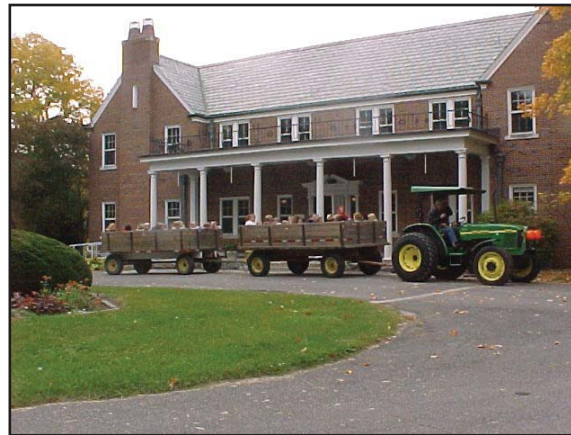
Tractor drawn hayrides at Bendix Woods County Park